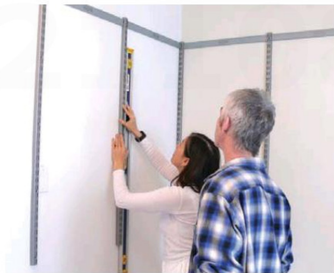
The entire closet hangs from the top horizontal bar, which can carry thousands of pounds of weight on the suspended vertical rods.